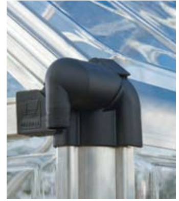
Gutter system allows you to drain rainwater