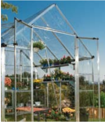
Extra wide doors provides easy access - 118cm / 45½"