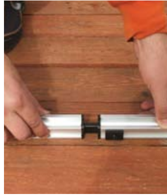
SmartLock™ connectors screws free